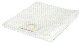
▶ 5-ply biodegradable cloth bags available in 3.75 g (17L) and 9 g (41L) sizes for the Generation 2 and Summit Series