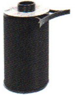
▶ ACTIVAC 2™ exhaust filter with activated carbon and HEPA filtration system