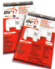
▶ 2-ply biodegradable paper bags available in 3.75 g (17L) and 9 g (41L) sizes for the 1000, 2000 and 3000 Series