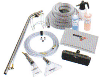
▶ Cleaning kit