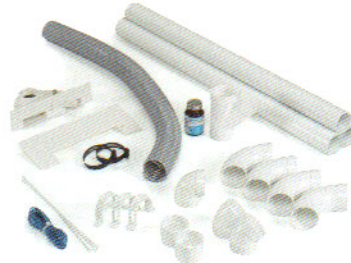
▶ Dustpan installation kit