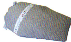
▶ Permanent sms with SILVERCLEAR™ antimicrobial-treated filter