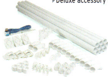
▶ 1, 2 or 3 inlet installation kit