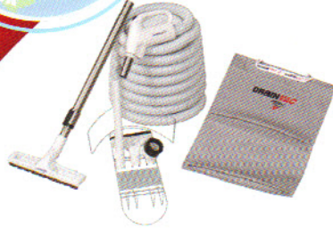
▶ Deluxe accessory kit