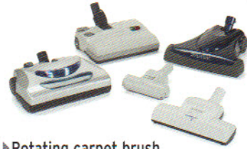
▶ Rotating carpet brush