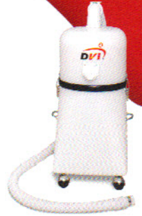
▶ Liquid extractor for vacuuming water and for cleaning carpets, upholstery, and more